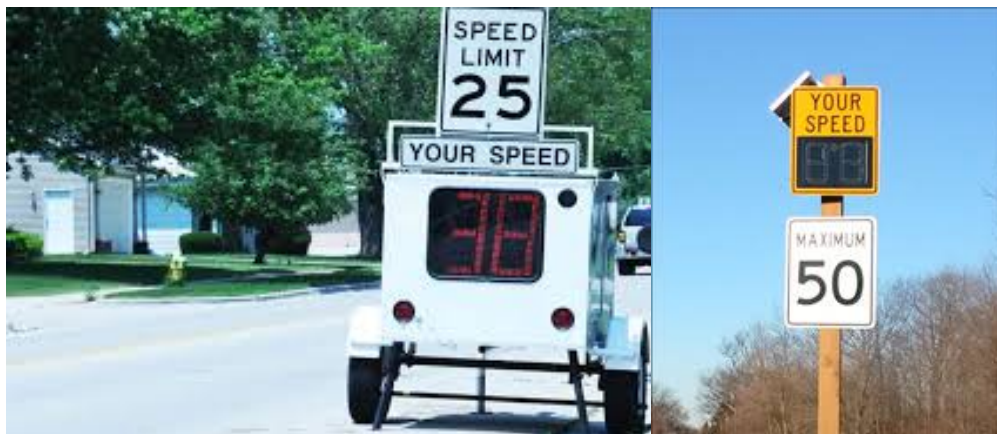
Figure 6 - Radar Speed Boards and Signs 3

Radar speed boards take many forms. The photos shown below show radar speed boards/signs mounted on a trailer and a post. The signs are designed to provide feedback to approaching drivers about their speeds and usually post a regulatory sign as well as a reminder of the posted speed limit. Many radar speed boards can digitally store the speeds that are recorded (and posted) which can be downloaded when the signs are decommissioned after use.