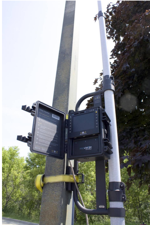
Figure 5 - Video Analytics Counters 2

The following table shows the assessment results for video analytics: