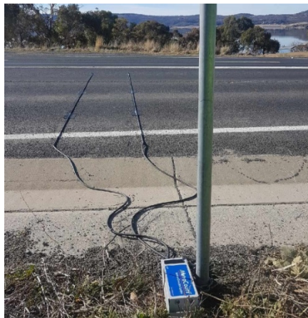
Figure 4 - Pneumatic Tube Counter 1

Pneumatic tube counters consist of a counter unit, usually chained to a pole at ground level, and flexible rubber tubes that are fastened to the road perpendicular to the travel lanes. As vehicles pass over the tubes, they squeeze the air inside which is registered by the recorder unit. Two tubes are needed to determine speed. They are set a known distance apart and the difference in time between pulses and the known separation of the tubes is used to determine speeds.