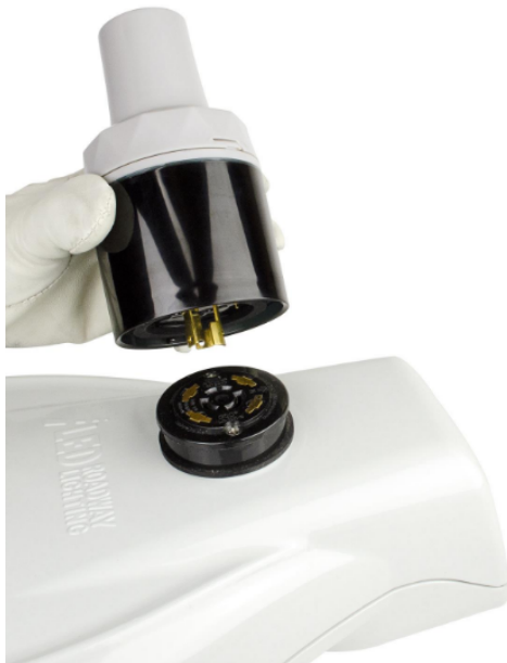
Figure 3 - Data Acquisition Platform Unit

The DAP technology can be applied for specific applications for local speed monitoring or be scaled to a wider network given its adaptability with existing streetlights for power. The use of the DAP unit on a wider network can help proactively identify safety and speeding issues while also generating data for the planning of future calming and enforcement initiatives.