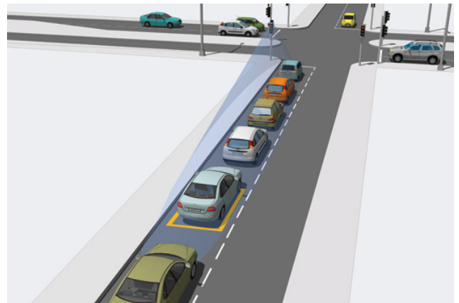
Traffic & Pedestrian Control