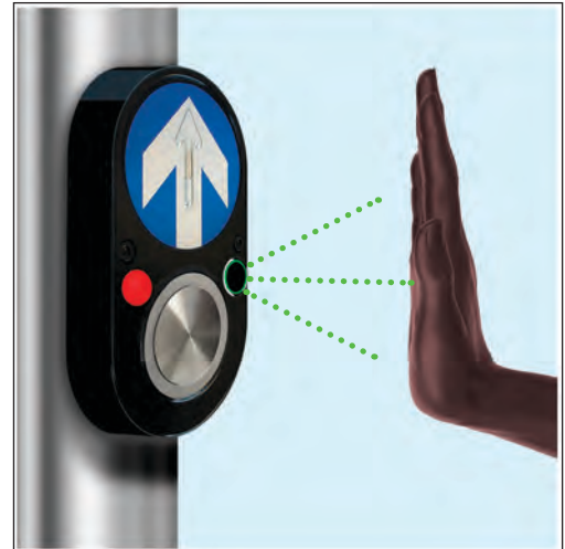
Sensor Activation between 3 – 12cm

The iTouch Sensor has been successfully tested to a 10,000,000 activation rate.