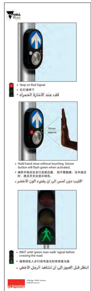
Above Pole Instruction Sticker – available in multiple languages

Aldridge offer a self-adhesive sticker for the mounting pole. This features crossing instructions in multiple language translations, to suit your particular requirements. Your road authority logo can be printed on the sticker as shown.