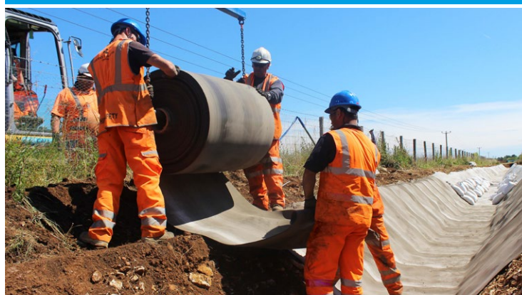
CC Bulk Roll