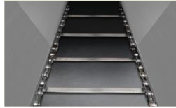
Wide width chain

Professional spreader for medium and big trucks, with feeding system realized by metal belt and cross-bars or rubber belt. In case of metal belt the large chain is guided by toothed pinions enabling a constant traction and a correct translation synchrony, without skidding.