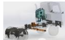
Special-reducer gearbox for 4x4s