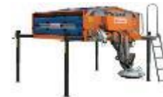
Extremely flat hopper design