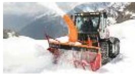
Snow cutter blower at work

Front snow cutter-blower, suitable for clearing snow and widening passages, also with high quantity of hard and frozen snow. Mechanically or hydraulically operated. A safety system with hydraulic clutches safeguards the transmission and a special brake blocks the blower in case of danger.