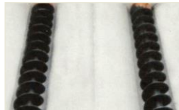
Double auger concept

Salt spreader with single or double auger feeding system to ensure utmost spreading precision and great visibility on the back side. Suitable both for salt and grit. In case of double auger, the hopper can be divided into two parts in order to be able to use both materials separately.