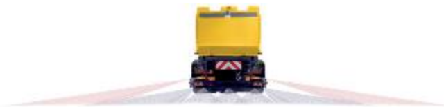
Spreading system with multiple nozzle sets

For medium and heavy trucks - capable of spreading different liquid solutions. Symmetrical and asymmetrical spreading possibility (till 17,5m)