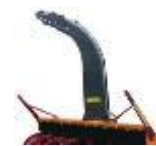
Loading ejection device on request