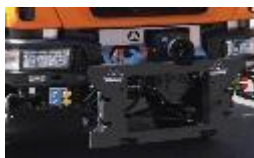
Front PTO for multi purpose vehicles

Transformation of a normal truck into a winter maintenance vehicle. Hydraulic system for front and rear equipments, fixed front mounting plate and interaxial installation of a special-reducer gearbox for turtle speed and high power front PTO to operate the snow cutter-blower.