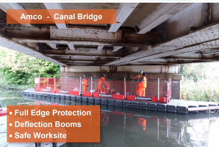
Amco - Canal Bridge