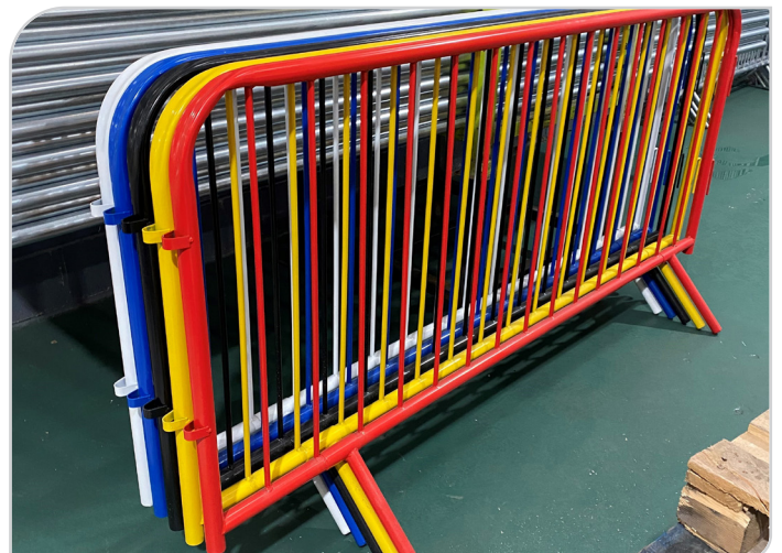
Options for different colours