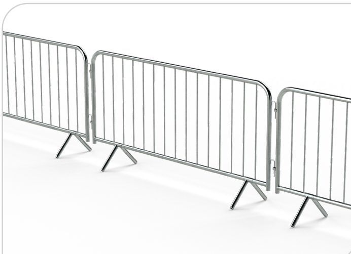
Line of connected pedestrian barriers