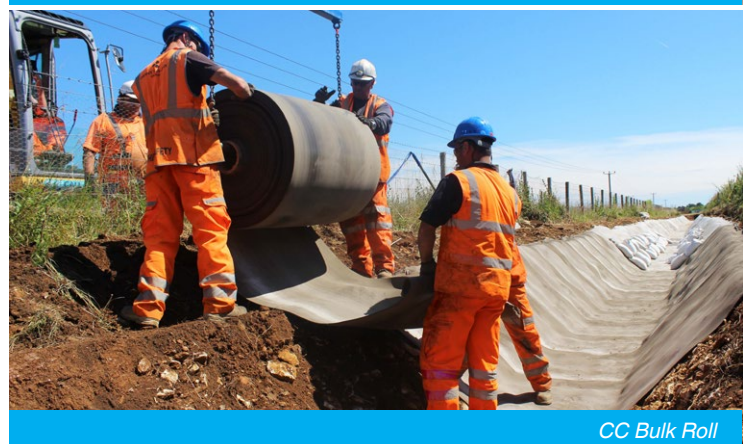
CC Bulk Roll