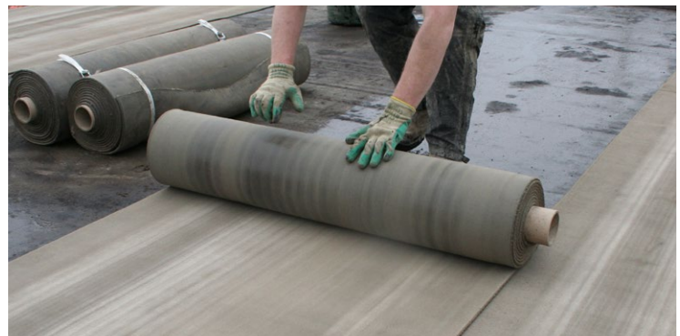
CC Batched Rolls