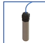
MN15 Reference Electrode