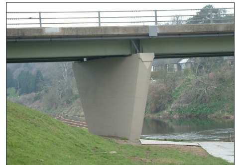
Finished pier 10 years after installation