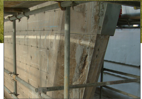
Visible spalling and loose concrete

With the use of a solar panel and modem communication, data from the DuoGuard installation can be downloaded at any time and measurements can be instigated without the need to travel to site.