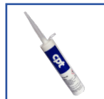
DuoCrete SD Mortar