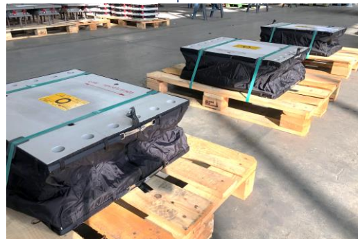
TETRON® SB spherical bearings with Bodygarde™ ready for shipment in Freyssinet factory