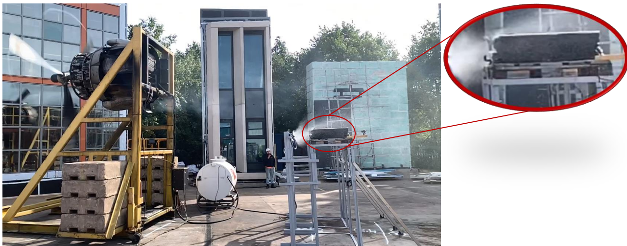
Wind and water spray test of Bearing Bodygarde™ above 135 km/h

One of the most important features of the bearings covers is to resist strong winds. BODYGARDE™ system has been subjected to an independent high velocity wind test, up to 135 km/h, in combination with dynamic water tightness test, according to United Kingdom's Centre for Window and Cladding Technology (CWCT) standards.