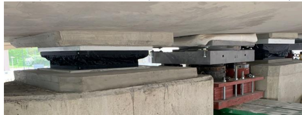
Bearing Bodygarde™ during bearing replacement works.

Protection system is also commonly used for remedial works on existing bearings, to provide them from degradation.