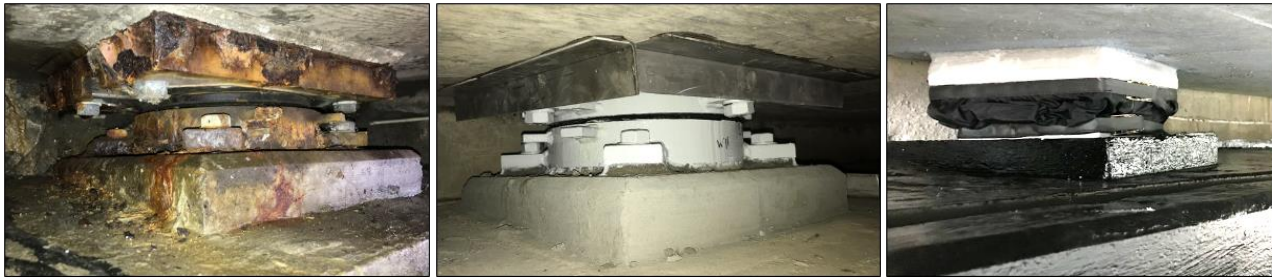
Steps of life extension of a pot bearing damaged by corrosion

Extending life of bearings reduces whole life carbon footprint. Freyssinet local units can assess the structure and work to maximize the life of the structural product.