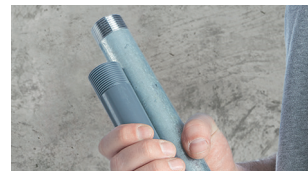
For metal & plastic joints