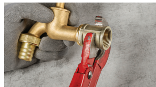
Re-adjust & back off to align fittings