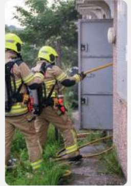
Fire and rescue